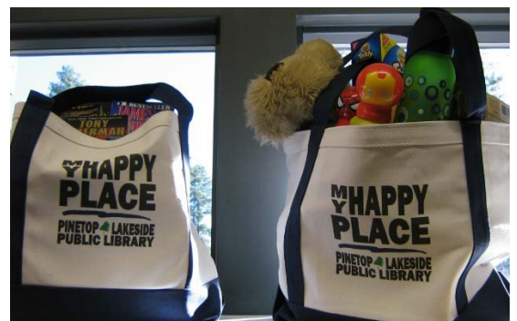
$15 tote bag fundraiser