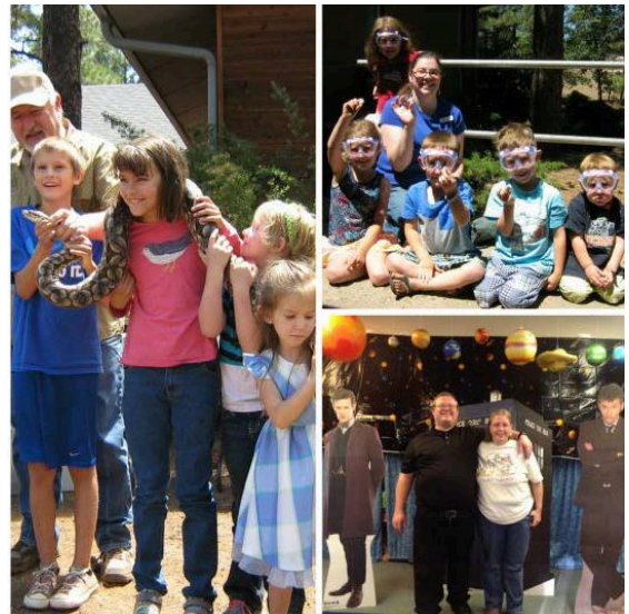
Summer Reading 2014

We participated in a pilot project with Maricopa County Library District to provide our Summer Reading program online through the Great Reading Adventure. We had great support from community organizations and local businesses, including a $2,000 grant from Dollar General Literacy Foundation. We created a FY14 Records Management Plan and a FY14 Technology Plan.