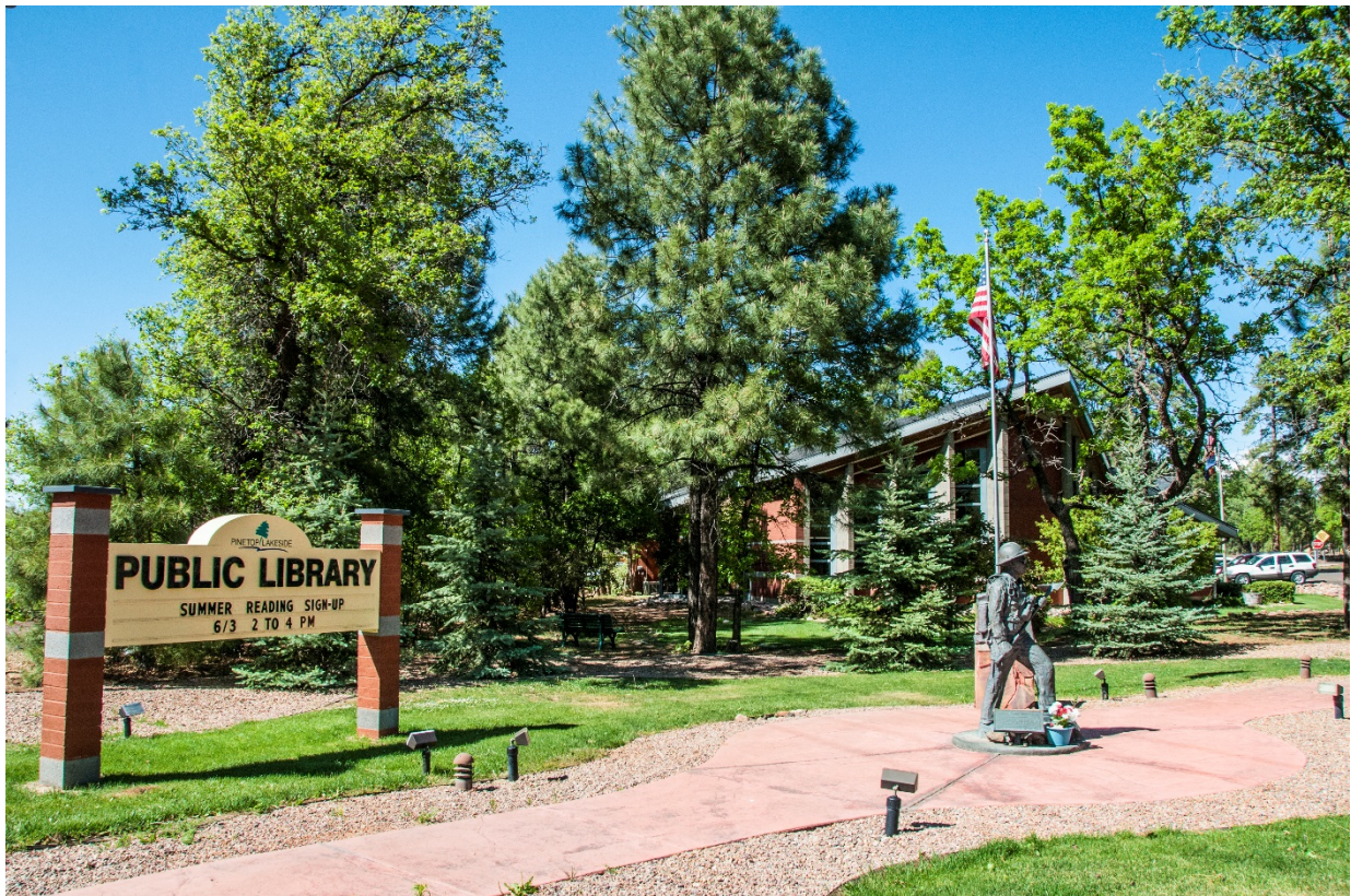
The library's new street sign, located near the wildfire memorial statue