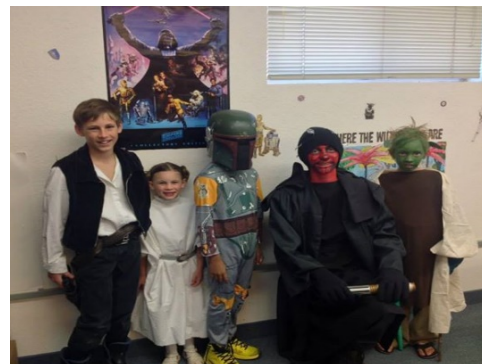
Participants in Star Wars Reads Day

We held an event for Star Wars Reads Day. We performed annual collection maintenance of the library collection. We conducted a Building and Grounds Survey.