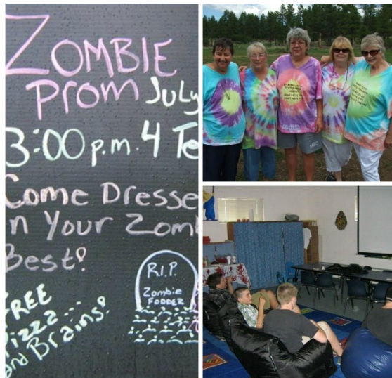
Summer Reading 2013

We concluded our annual Summer Reading program. We completed redesigning the Kids' Corner, including a beautiful three-part wall mural by Carole Fogle, a new rug, kid-friendly furniture, and a magnetic sand table.