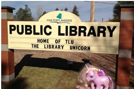
Our new street sign

We installed our first-ever street sign (it only took 84 years!). We held events for National Library Week, National Volunteer Week, and World Book Night.