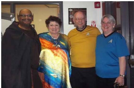
Trekkies at a Movie of the Month program

We added a few new magazine subscriptions to the library collection.